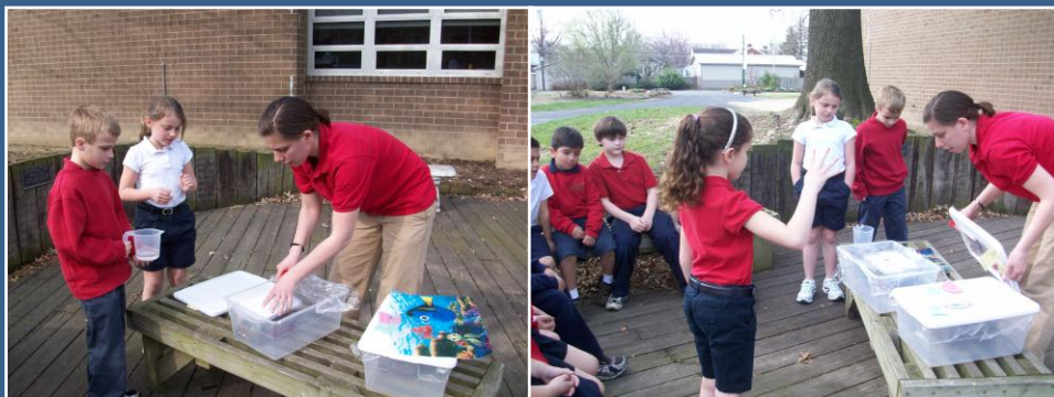
Pictured Above: Holy Rosary students observed landfills, dumps, and compost bins that were created as part of their science unit.