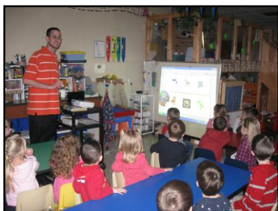
Pictured Above: Kinder Haus Preschool students are learning how to use the E-beam!

The Kinder Haus Preschool students in the 3-day classes that will advance to kindergarten next year had the opportunity to participate in an exciting way to sharpen their skills in recognizing letters of the alphabet and matching them to objects that begin with the sound that each letter makes. Through the use of the E-Beam Edge technology system, students were engaged in an interactive literacy lesson that focused on the letter “w.” What a great opportunity for our young children to have such a wonderful way to experience an example of the advanced technology that other students from K-5 have access to here at Sts. Peter and Paul.